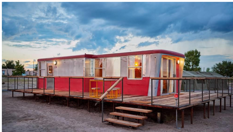
Overnight lodging in Marfa, Texas

A potential site for this activity center could be the front of the vacant 13-acre tract near the intersection of Allgood and Rockbridge Roads. Alternatively, a variety of uses could be split up in different locations along the corridor.