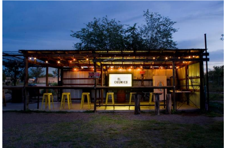
El Comisco Kitchen in Marfa, Texas